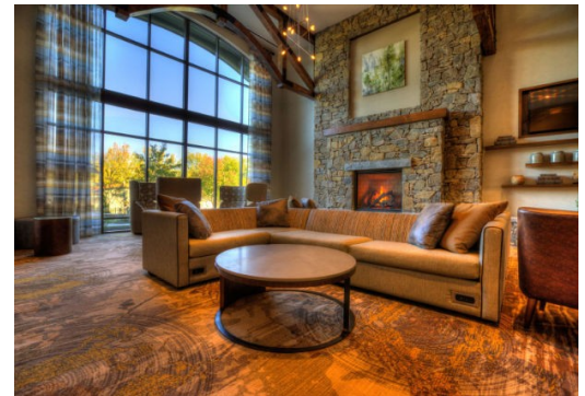
The lobby of the Courtyard Marriott.

We hope you consider joining us for family fun and education!