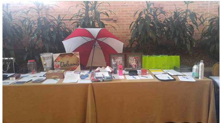
Silent auction from convention 2016. There will be more goodies to shop this year!

At the 2017 TDOA convention if you choose to donate $100 or more you will be entered in a drawing to win your 2018 TDOA membership for free! (All PAC funds are separate from the TDOA.)